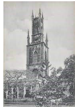
Cathedral tower, 1907